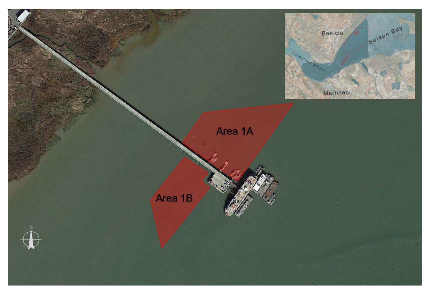
Figure\ 2:\ Area\ 1\ Project\ Location\ and\ Limits\ .