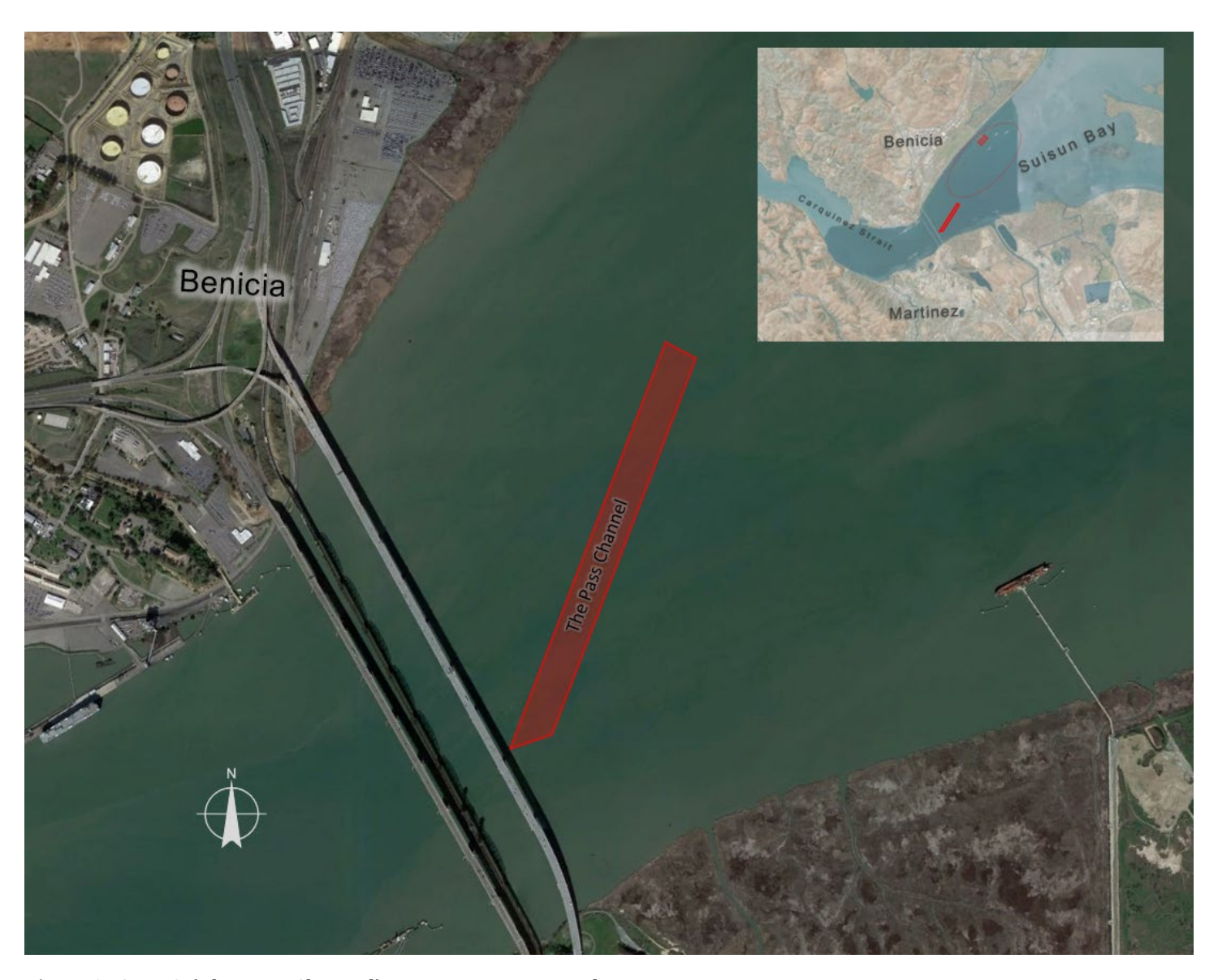
Figure 3: Area 2 (The Pass Channel) Project Location and Limits.